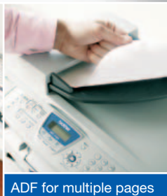
ADF for multiple pages