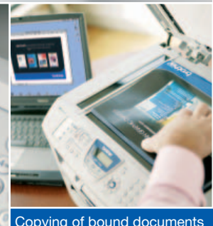
Copying of bound documents