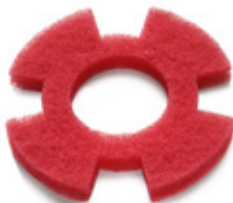
Red Light cleaning K.20.72.1213.1