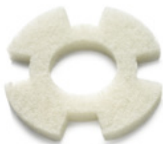
White Delicate cleaning K.20.72.1213.2