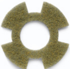
Yellow Renovation K.2.72.1216.8