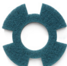
Blue Daily cleaning K.2.72.1216.797