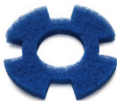
Blue Medium Cleaning K.20.72.1213.79