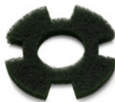
Black Agressive cleaning K.20.72.1213.0