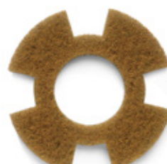
Orange Renovation* K.2.72.1216.4