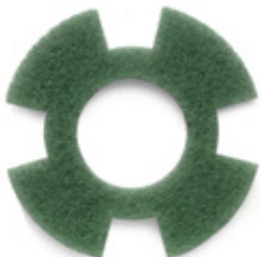
Green Daily cleaning K.2.72.1216.64