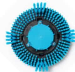
Use in combination with all our i-pads K.2.S.72.1214.797