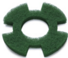
Green Heavy cleaning K.20.72.1213.64