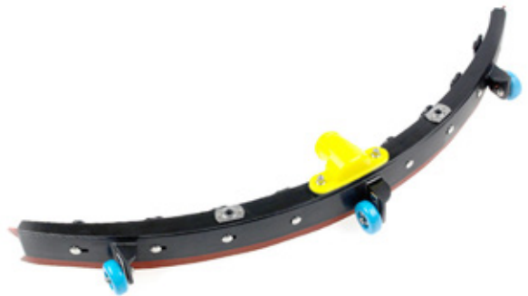
For oily/greasy environments